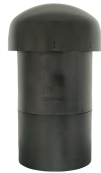
LS12T SUB (Dark Brown) SKU# 93371