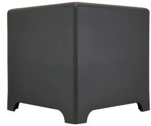
HS12T SUB (Dark Brown) SKU# 93373